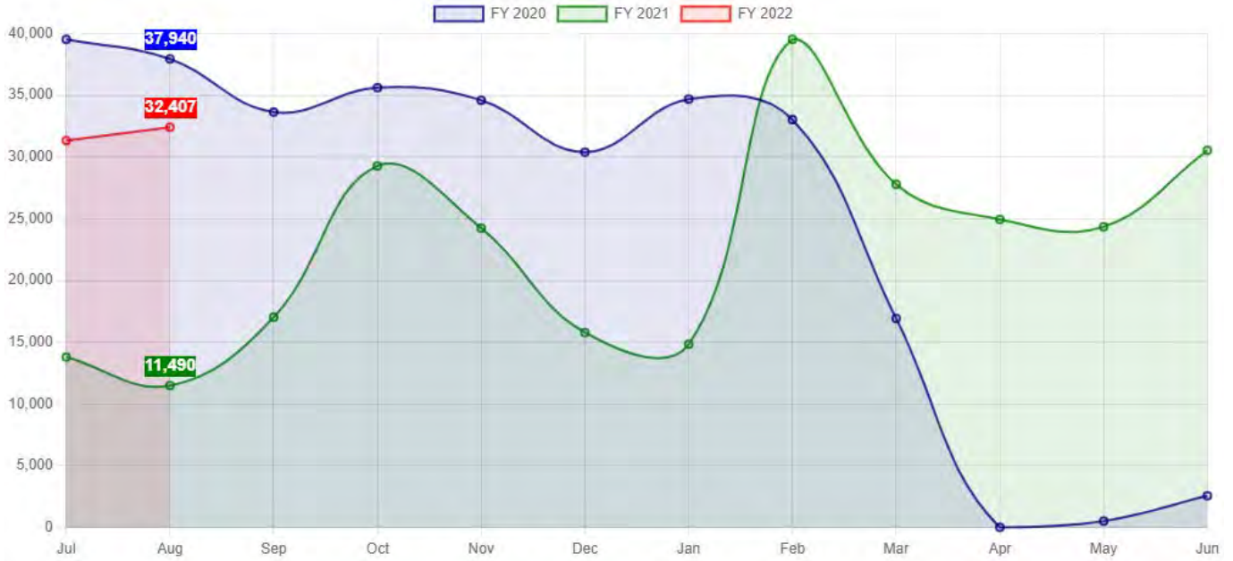
3 Year Circulation Comparison