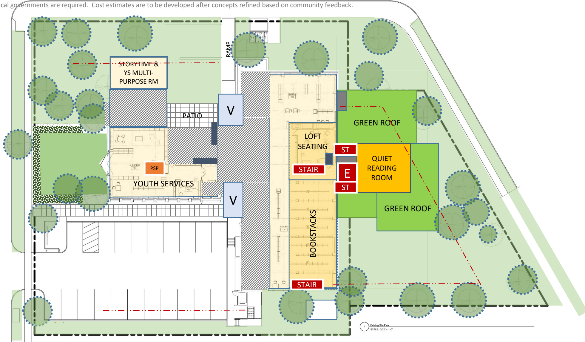
1 Existing Site Plan SCALE: 3/32" = 1'-0"